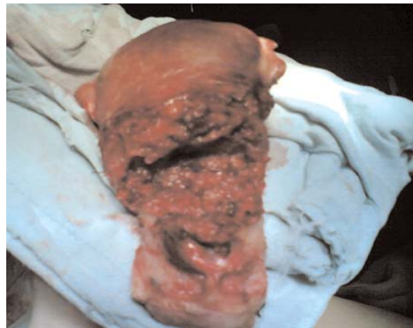
Fig.1. Implantation site of pregnancy in anterior wall of uterine isthmus.

Catastrophic hemorrhage may occur when surgical evacuation is attempted, because the defective myometrium & uterine cervix are naturally less capable of fibromuscular contraction