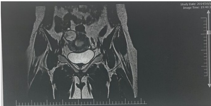
Fig. 1. Sagittal view of pelvic MRI