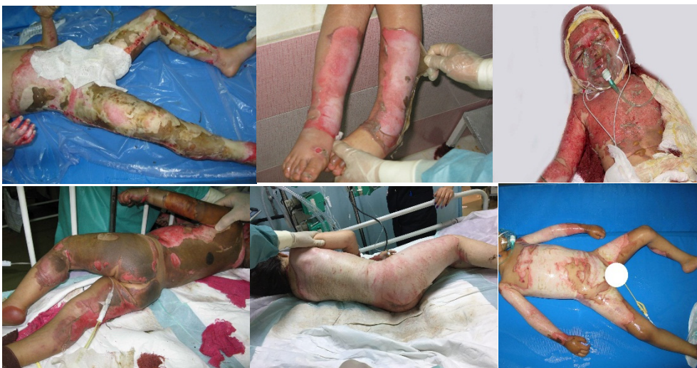
Fig. 1. A total of 115 isolates were studied during current survey in 2016 (The Medical Ethic Committee permitted us for releasing pictures)

Antimicrobial susceptibility of colistin against A. baumannii isolates was investigated by the minimum inhibitory concentration (MIC) method. Colistin sulfate (Sigma-Aldrich, St. Louis, MO, USA) was tested over a range of dilutions (64-0.5µg/ml). For this purpose, 100 µl colistin sulfate (diluted in water) 128 mg/ml were added to 96-well U bottom microplates. In the following 10µl of bacterial suspension containing 1.5 \times 10^5 CFU/ml of cells was added to wells with serially different concentrations of colistin. In the end, the microplate was incubated in ambient air at 37 °C for 24 h. The breakpoints of The Clinical and Laboratory Standards Institute (CLSI) were applied as references (12).