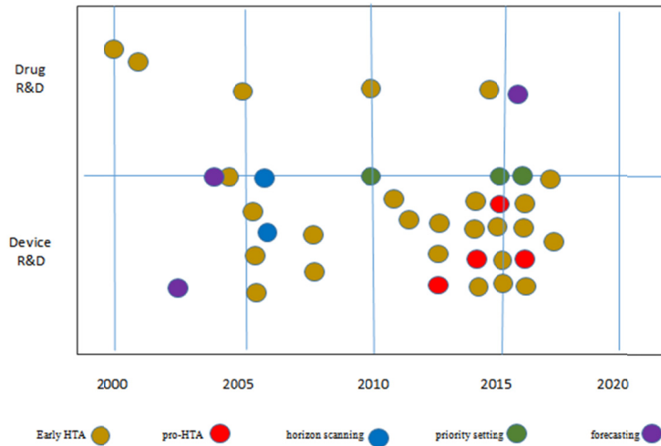
Fig. 2. Review studies presenting iterative economic evaluation in drug and medical device development, based on technology evaluation methods

made technologies. The general steps of this approach include 1. Identification: identification of emerging pharmaceutical and non-pharmaceutical technologies. 2. Filtering: Selecting the most important and most efficient technologies from the experts' point of view. 3. Priority setting: Prioritize these technologies based on different evaluation criteria from the perspective of each country. 4. Assessment: using evaluation methods for comparing two drugs or interventions in two different therapies (16).