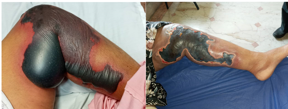
Fig. 1. Foot sepsis lesion of a COVID-19 patient. Left: on the onset of the disease; right: 2 weeks after.

In this study, the patient was a 68-year-old woman who had no common symptoms of COVID-19 and had only fever, anorexia, and nausea. She was initially visited with coagulation disorder and extensive sepsis bleeding, and COVID-19 disease was diagnosed for her during the additional examinations through a lung scan. So far, there have been few reports of skin lesions resulted by COVID-19 worldwide and in Italy (7), which was one of the centers of the disease. In Recalcati et al study on COVID-19 patients, there were a number of patients with skin manifestations like erythematous rash, extensive urticaria, rashes such as chickenpox and sometimes pruritus after hospitalization. The lesions usually healed within a few days. Studies at Medical Center (UNMC) at the Department of Dermatology of University of Nebraska showed that the existence of the skin rashes in 0.2% to 1.2% of the 1099 patients with COVID-19 in the laboratory by January 29,