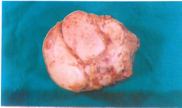
Fig. 1 (A). Well-circumscribed mass with smooth creamy white external surface.