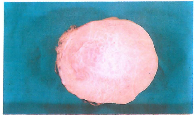
Fig. 1 (B). Cut surface of tumor with rim of pancreas.