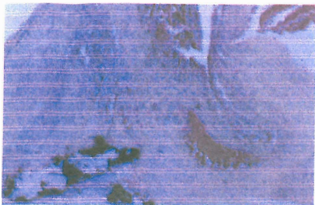
Fig. 2. High-power photomicrograph shows that the A-V fistula has vessels that are thickened and hyalinized and a fibrotic stroma with focal calcification.

A wedge liver biopsy showed dilated and congested centrilobular veins (Fig. 3).