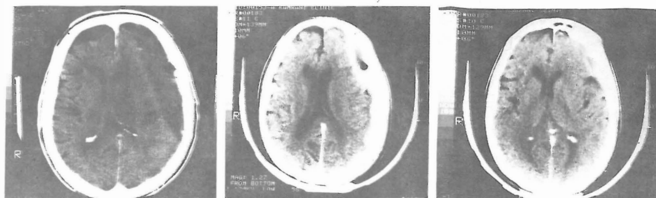
Fig. 1. Preoperative computed tomography of case I revealed left frontoparietal subdural collection (A). Postoperative CT scan the following day (B) and six months later (C).

available separately in our cases to rule out reinfection, isolation of the same organism from the secondary infection site emphasizes a recrudescence pattern, due to curtailed cellular and humoral immunity and the ability of the organism to coexist with the host for a long period.