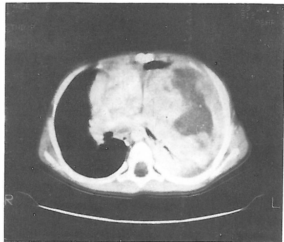
Fig. 2. Contrast-enhanced CT reveals a round mass in the upper lobe with an enhancing rim and irregular center.

most often encountered are carcinosarcomas and pulmonary blastomas.