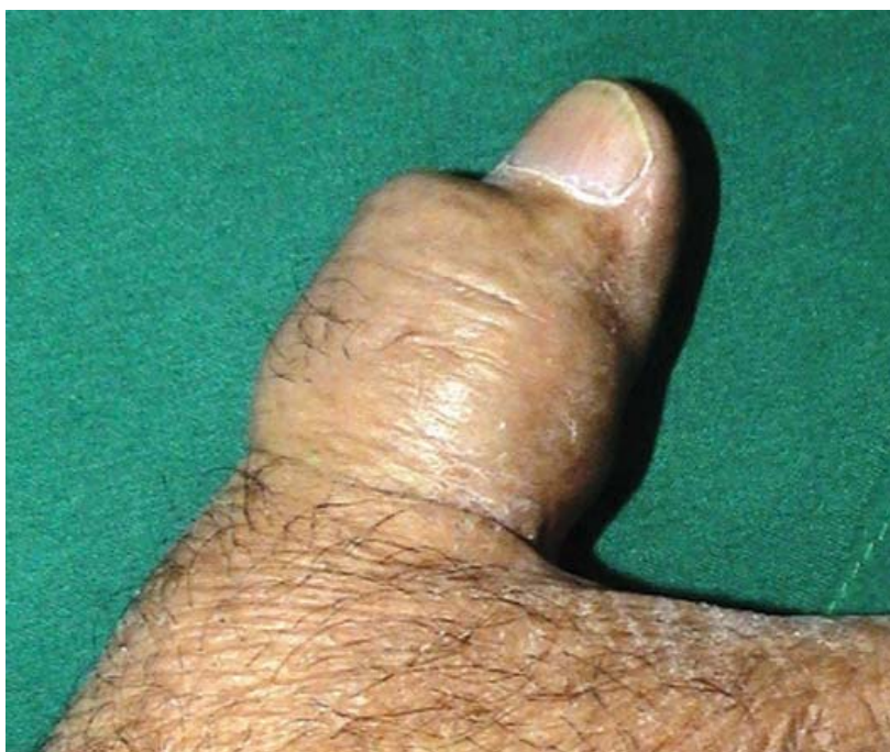
Fig 1. Photography of right thumb, with the lesion.

sented to our department with an enlarging mass on the right thumb. The lesion formed on the dorsal surface of the proximal phalanx, 1 year before the presentation. He had no history of previous trauma or infection. His past medical history consisted a cervical spine fracture, which was treated with spinal fusion 7 years ago. At presentation, the lesion appeared to cover the entire proximal phalanx, which was diffusely swollen (Fig 1). Thus patient had severely limited range of motion for thumb IP joint. The mass was not tender and thumb had normal two point discrimination. There was no alteration in skin or proximal adenopathy. There was no hypercalcaemia or preoperative anaemia and erythrocyte sedimentation rate and C-reactive protein, were within normal limits.