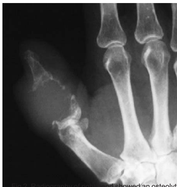
Fig 2. Radiography of right hand showed an osteolytic lesion of thumb proximal phalanx.

and destructive lesion, involving proximal phalanx, and was isointense on T1-weighted images and hyperintense on T2-weighted images. The tissue mass was expanded to the IP joint and dorsal aspect of proximal phalanx, nonetheless technetium-99m bone scan showed a single focal area of mild increase uptake at the right