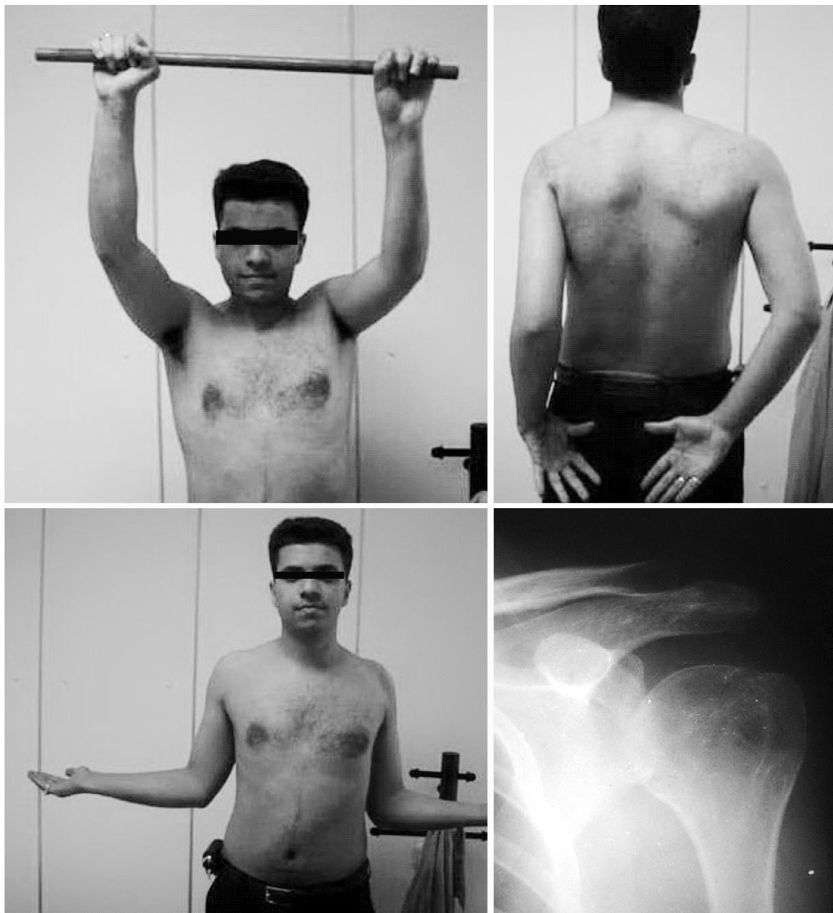
Fig 1. (cont.) D. Range of motion and x-ray 2 months post operation.

cation with an impression fracture involving less than 25% of the humeral head who were treated by open reduction together with posterior cruciate capsular repair (shift) as described by Neer. After a minimum follow-up of 5 years (range, 5–10 years), the average UCLA score improved from 18 preoperatively to 33 postoperatively. They concluded that open reduction with posterior cruciate capsular repair offers a