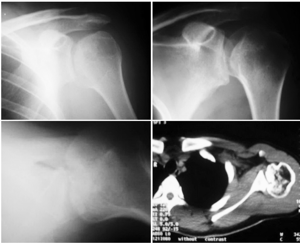
Fig 1. (cont.) Preoperative x-rays and CT-scans.

rovascular status, pain, shoulder range of motion and bone stock.