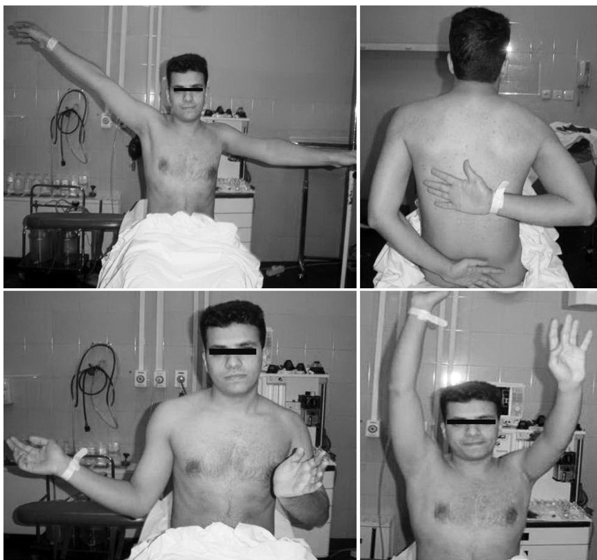
Fig 1. A 27 year old man with neglected posterior dislocation of the left shoulder since 8 months ago was treated with open reduction and temporary K-wire fixation.

electrical shock or trauma, with painful and limited external rotation of the shoulder indicates a posterior dislocation.