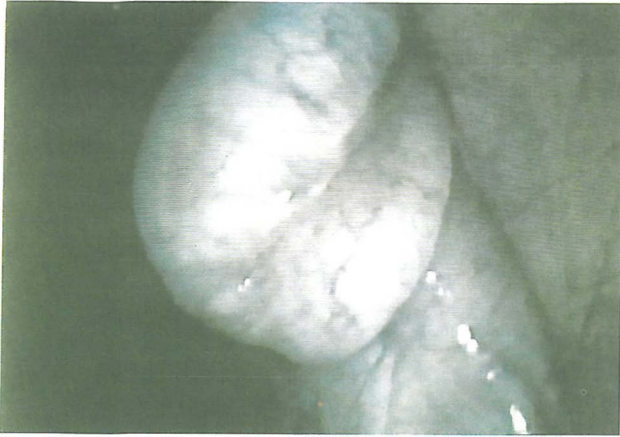
Fig. 1. A cryptorchid testis present at the internal inguinal ring within the abdomen of a child which was easily diagnosed laparoscopically.