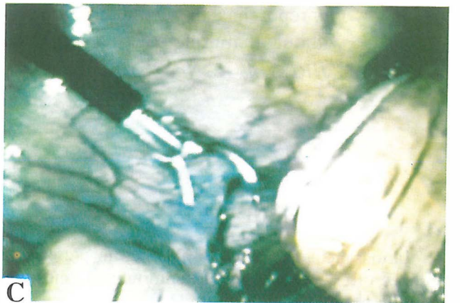
Fig. 2. a. Laparoscopic view of an intra-abdominal testis, showing the vas deferens entering the testis medially. b. The gubernaculum of the testis has been transected, the vas deferens freed, and the testis slowly being prepared for extraction. c. The spermatic vessels and vas deferens have been dissected completely and are shown while being pulled through the inguinal canal. The testis is no longer present within the abdomen and cannot be seen anymore with the laparoscope.