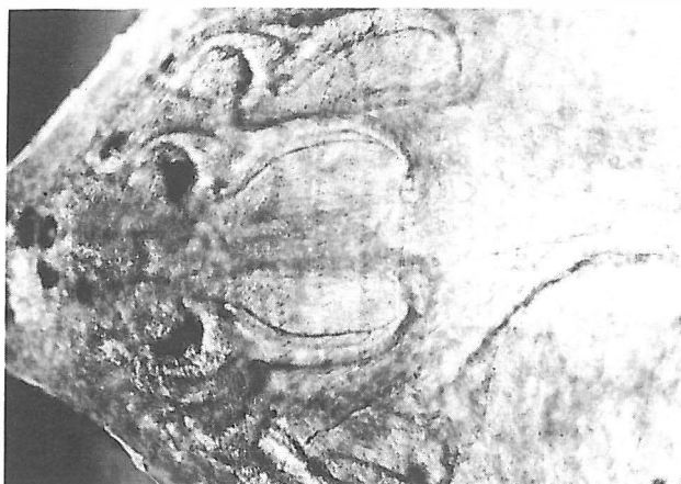
Fig. 2. Linguatula serrata demonstrating the anterior part with hooks and the mouth part.