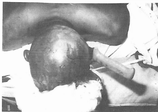
Fig. 3. The handle of the knife and head position is shown.