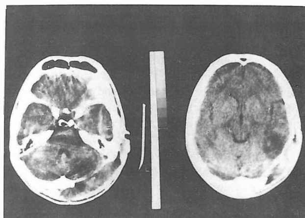
Fig. 4. Postoperative CT scan shows porencephalic area in left cerebellar hemisphere.