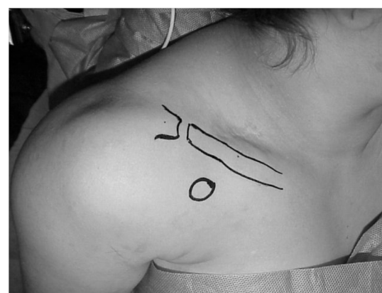
Fig. 3. Roberts approach of acromioclavicular joint and coracoid process of scapula.

oid osteoma, it is not often included in the differential diagnosis of chronic shoulder pain (7). The night pain seen is often attributed to rotator cuff pathology. However,