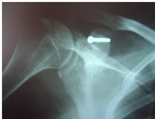
Fig. 4. Post up controlled shoulder plain x-ray.

Du ssaussois L et al reported a new thera-