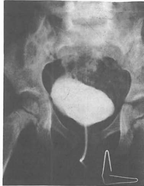
Fig. 4. Retrograde cystogram of the patient demonstrating no duplication or vesicoureteral reflux.

orthotopic (in the pubic area) and the other located in the perineum. Both phalli were smaller than normal with no urethra or urethral meatus (Fig. 1). The scrotum was mildly bifid, and a perineal hypospadias existed with meatus located in the anterior anal verge (Fig. 2).