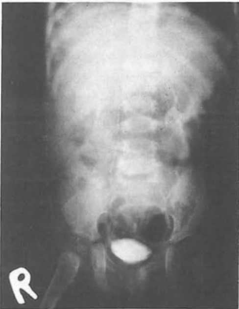
Fig. 3. Intravenous urogram of the patient showing both kidneys and ureters with no abnormalities.

orthotopic (in the pubic area) and the other located in the perineum. Both phalli were smaller than normal with no urethra or urethral meatus (Fig. 1). The scrotum was mildly bifid, and a perineal hypospadias existed with meatus located in the anterior anal verge (Fig. 2).