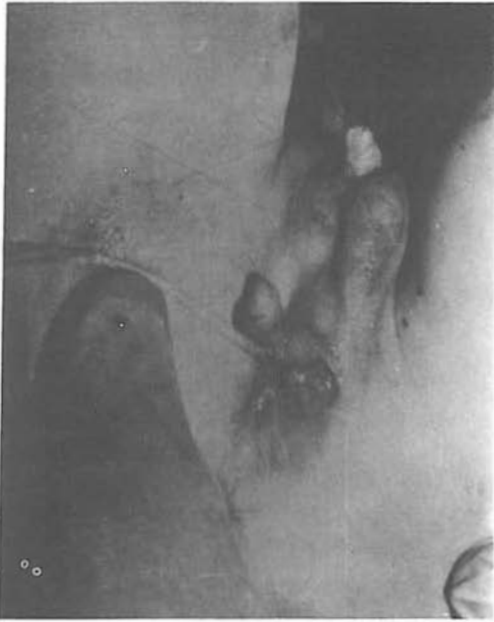
Fig. 2. Another picture of the patient showing positions of two phalli, anus, and urinary meatus in anterior anal verge with catheter.