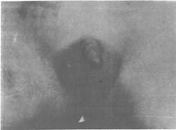
Fig. 5. Picture showing the patient after ectopic phallus excision and right orchiopexy.