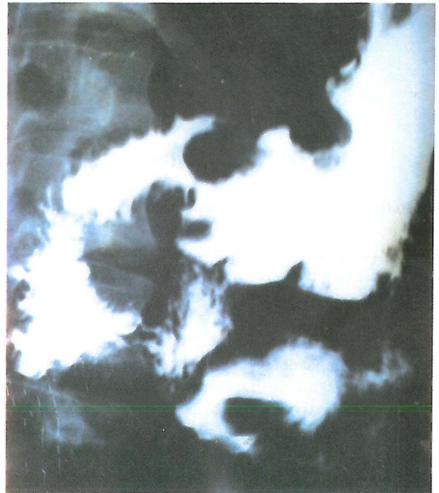
Fig. 5. An upper GI series showing multiple, nodular, ulcerating mass lesions in the fundus, body and antrum, the duodenum and the jejunum.

function tests, liver and bone marrow biopsies, and abdominal CT-scan were normal. An air-contrast barium enema revealed a diffuse nodular pattern evenly distributed throughout the colon. Upon colonoscopy the polyps were fairly uniform in size, ranging from 5 to 20 mm. Some were