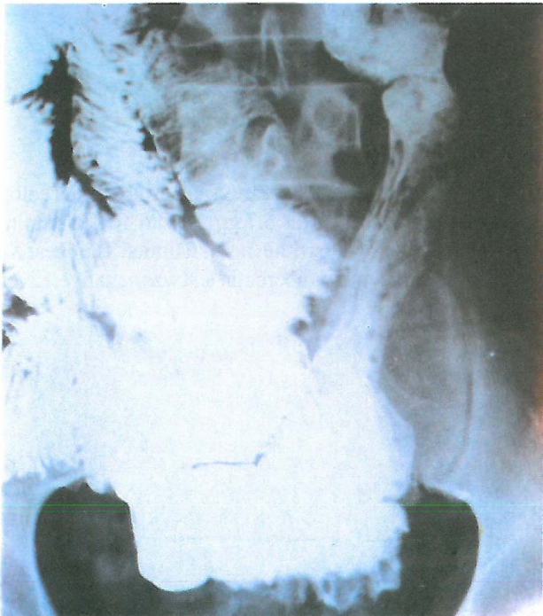
Fig. 3. Small bowel roentgenogram showing a fine feathery mucosal pattern extending from the duodenum to the distal ileum consistent with diffuse small bowel infiltrates.