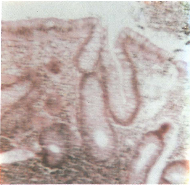
Fig 2. Biopsy of a colonic polyp showing nodular aggregates of monomorphous, small lymphocytes, the lamina propria and adjacent submucosa.