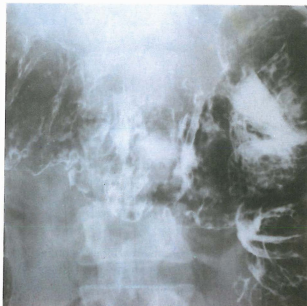
Fig. 1. Air-contrast barium enema showing a nodular pattern.

7,000/ \mu L with normal differentiation and no abnormal cells. The serum protein level was 5.7 gr/dL with 46% albumin. Other serum values were within normal limits. The chest X-ray was normal. The skin tuberculin test was negative. Liver