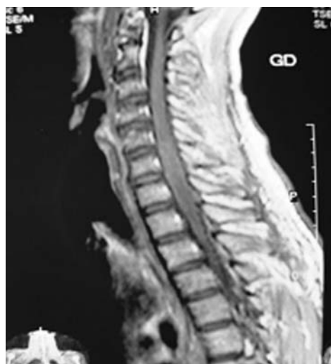
Fig. 2. T1 MRI with contrast shows no enhancing cord expansion in C5-T2 level.

evident that he could not move his legs. The patient had flaccid paralysis of legs, acute urinary retention, and diminished rectal tone.