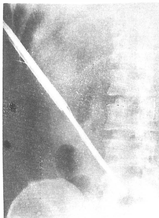
Figure 1. An 11.5F ureteroscope is introduced through a nephroscope sheath into the ureter to treat a stone at the level of L5.

stomach. The retrograde pyelography was performed under fluoroscopy in preparation for percutaneous nephrostomy. If the contrast medium could not by-pass the stone, intravenous contrast medium or puncture of the pelvocalyceal system with a fine needle for injection of contrast medium was required for pelvocalyceal