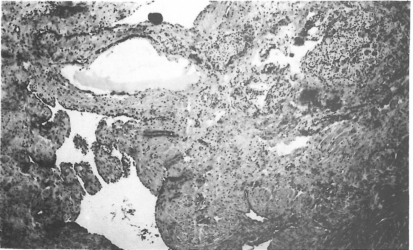
Figure 2. Thick-walled vessels are prominent. Note the ganglion cells in the upper right corner (H & E, original magnification X45).