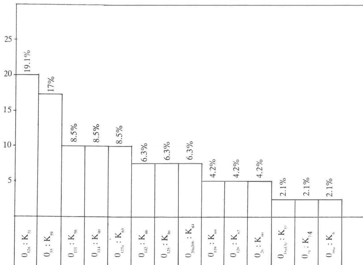
Histogram No 1: Frequency of Enteropathogenic E. Coli Serotypes Isolated at the Children's Medical Center and Takhti Children's Hospital, both in Tehran.

have been known to be the main cause of most of the cases of gastroenteritis in developed countries. A study conducted in the United States, showed that Rotaviruses have been the cause of 19% of cases 7,10,11 .