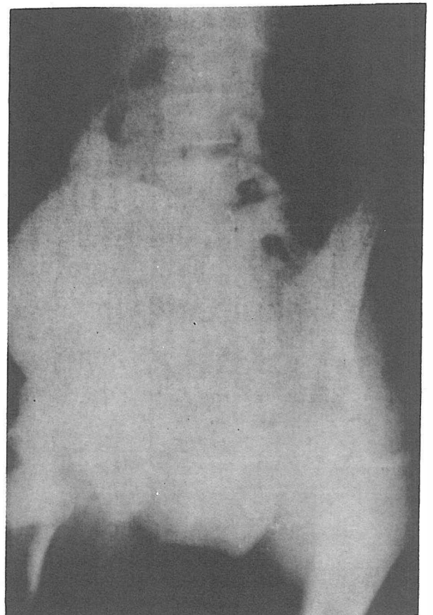
Fig. 1. A vesicourachal diverticulum demonstrated in a cystogram of a young male.