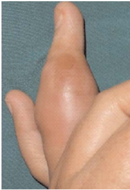
Fig. 1. Photography of left ring finger showed erythema and soft tissue swelling.