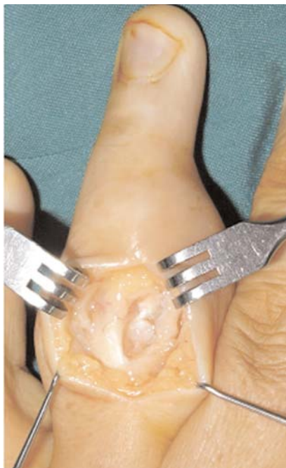
Fig. 3. An incisional biopsy was performed.

with subcutaneous swelling (Fig. 1). The tumor was remarkably hard and seemed to be fixed to the skeleton of the finger. The overlying skin was pink and the tumor was severely tender. The PIP joint range of motion was limited compared to the right ring, whilst motion of the