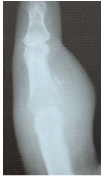
Fig. 2. Radiograph of left ring finger.

with subcutaneous swelling (Fig. 1). The tumor was remarkably hard and seemed to be fixed to the skeleton of the finger. The overlying skin was pink and the tumor was severely tender. The PIP joint range of motion was limited compared to the right ring, whilst motion of the