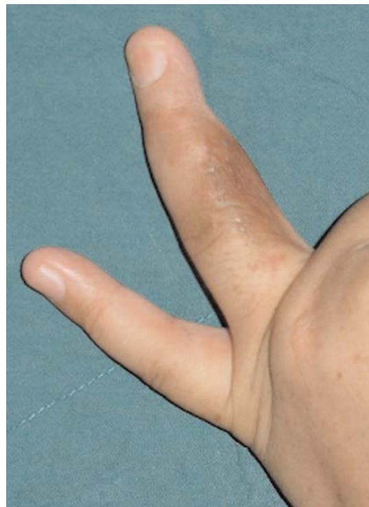
Fig. 5. Photograph two month after incisional biopsy.

In 1981 Spjut and Dorfman [6] reported cas-