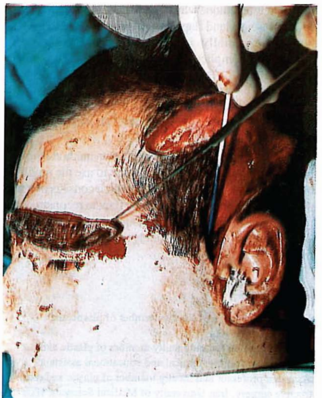
Fig. 3. A. Eyebrow island flap is placed in the recipient area.