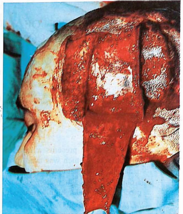
Fig. 2. B. Dissection and elevation of the temporoparietal fascia from the deep fascia situated in the temporal region.