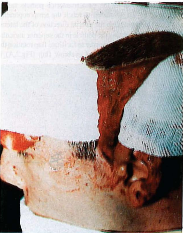
Fig. 2. A. Elevated island flap with vascular pedicle.