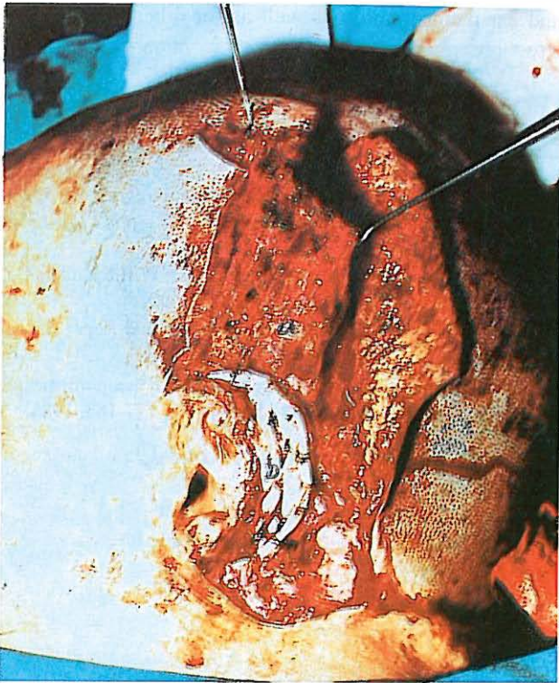
Fig. 3, B. Placing the temporoparietal fascia over the presculpted rib cartilage framework.