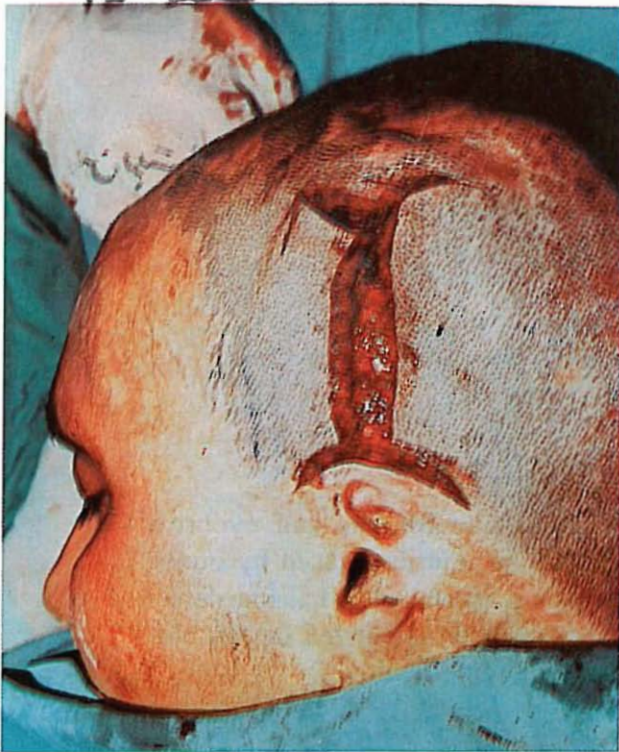
Fig. 1. B. Skin incision around the auricle.