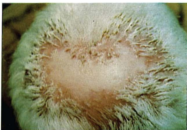
Fig. 1. Scarring alopecia with tufted hairs arising from a common ostium.