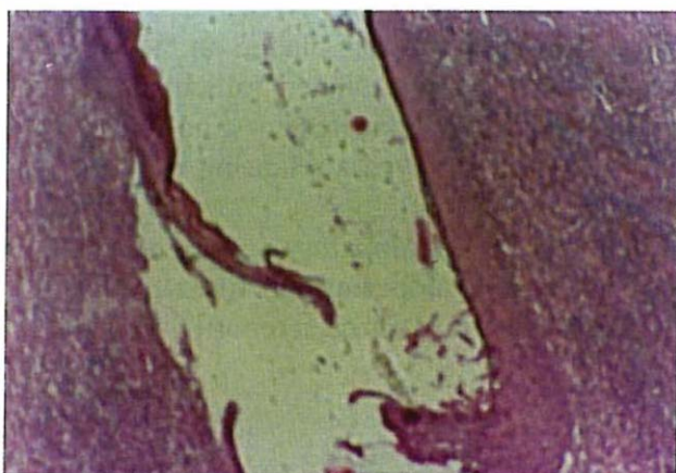
Fig. 2. A dilated common follicular duct surrounded by monocyctic and histiocytic infiltrations.

Age of onset varies from 19-53 years. The disease appears as a single or multiple erythematous exudative plaques involving the scalp. Within the affected areas, several tufts of 5 to 20 normal hairs emerge from a single follicle 1-4 (Fig. 1) Over a variable period from weeks to months, local tenderness, exudation and pruritus indicate recurrence and exacerbation. After subsequent relapses, an erythematous, scaly and cicatricial alopecia with new tufts of hair appear around the plaque.