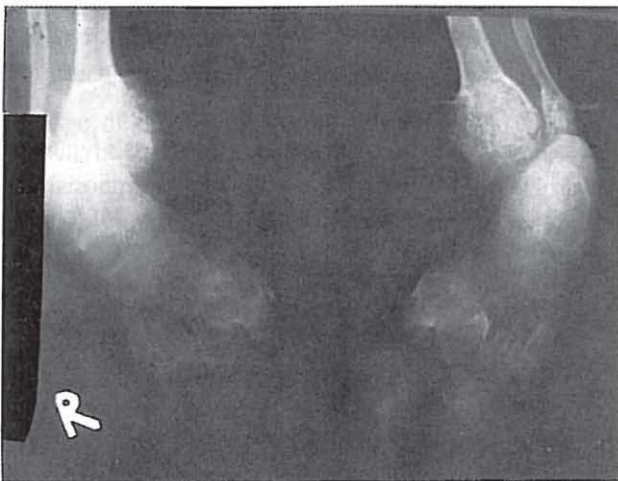
Fig. 3. Distal ends of all bones in feet were bulky and over grown also.

particularly in the hands or on the distal ends of the long bones. They are somewhat elastic and may cause limitation of motion in adjacent joints. Phalangeal chondromas may lead to severe deformities of the fingers. 8,9,11-14