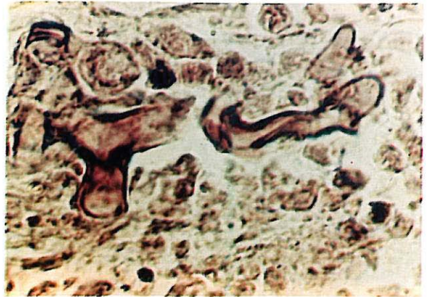
Fig. 3. Ribbon-like hyphae in tissue (PAS × 1000).