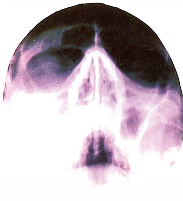
Fig. 2. X-ray shows opacity of right maxillary sinus and hypertrophy of left sinus mucosa.