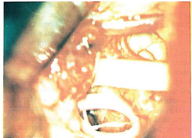
Fig. 3. Facial nerve separated from AICA by a piece of muscle.