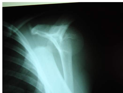
Fig 1. Severely displaced proximal humeral epiphyseal separation.

Yagubyan (5) presented 4 cases of axillary artery thrombosis from humeral neck fracture. His review of the literature revealed 24 cases of axillary artery injury associated with humeral neck fracture. In all reviewed cases, the mean age was 66.6 years and fall the most common mechanism of injury the (79%). Some 46% of patients presented with a neurologic deficit and acute ischemia was present in 68% of patients. Physical examination predicted the arterial injury in all but 1 patient. Vascularization by an interposition graft was the most common repair proce-