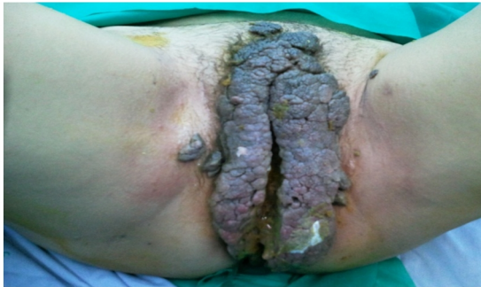
Fig.1. Condyloma acuminatum lesion on the genital area