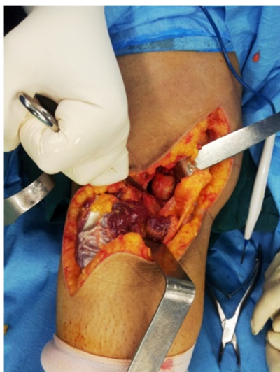
Fig. 2. Posterior transverse capsulotomy

heads of gastrocnemius were detached and posterior transverse capsulotomy was performed (Fig. 2). After complete excision of the tumor body, capsule was repaired and both heads of the gastrocnemius were reattached to their remnants. Then patients underwent aggressive physiotherapy for regaining range of motion using a continuous passive motion (CPM) machine. After achieving the complete range of motion, the second staged anterior approach was performed with standard anteromedial knee arthrotomy. This method seems to be effective because all patients regained complete range of motion in a few days and no patient needed further knee manipulation. Also, KSS score was increased significantly in these patients. It seems that for