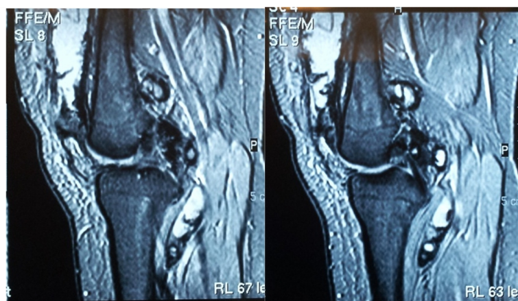
Fig.1. Diffused form of PVNS

Our surgical method of choice: In this method we first approached posteriorly in prone position with lazy- S skin incision. After isolation of neurovascular bundle two