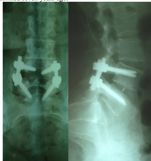
Fig. 2. Postoperative radiographs of the patient shown in Fig 1. Note that instrumented TLIF restored both intervertebral height and lumbar lordosis.