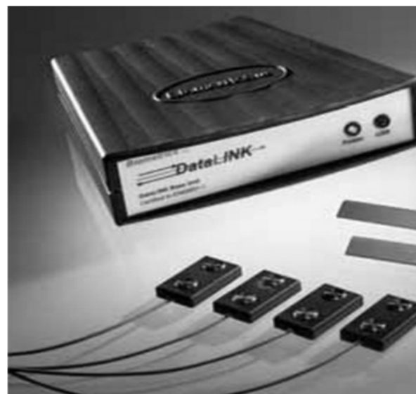
Fig. 2. DataLink surface EMG system and its electrodes

Numerous factors affect the quality of sEMG acquisition such as inherent noise in the electronic equipment, ambient noise in the surrounding atmosphere, motion artifacts and poor contact with skin. The first three factors are dependent on the sEMG acquisition system used and to reduce the effects of these, a DataLINK (Biometrics Ltd; UK) sEMG