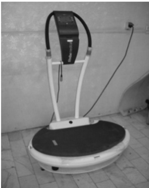
Fig. 3. Fitvibe vibration system.

After the electromyographic activity capture, the RMS value of the EMG signal was used as a means for measuring the amplitude of the voluntarily elicited EMG signal. The RMS values, as the preferred method of normalization, were measured at the peak of activity during MVIC of the muscles (31).