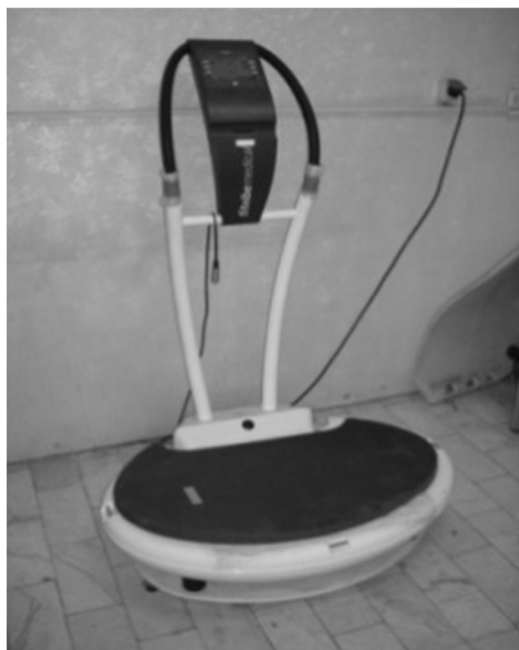
Fig. 3. Fitvibe vibration system.

After the electromyographic activity capture, the RMS value of the EMG signal was used as a means for measuring the amplitude of the voluntarily elicited EMG signal. The RMS values, as the preferred method of normalization, were measured at the peak of activity during MVIC of the muscles (31).