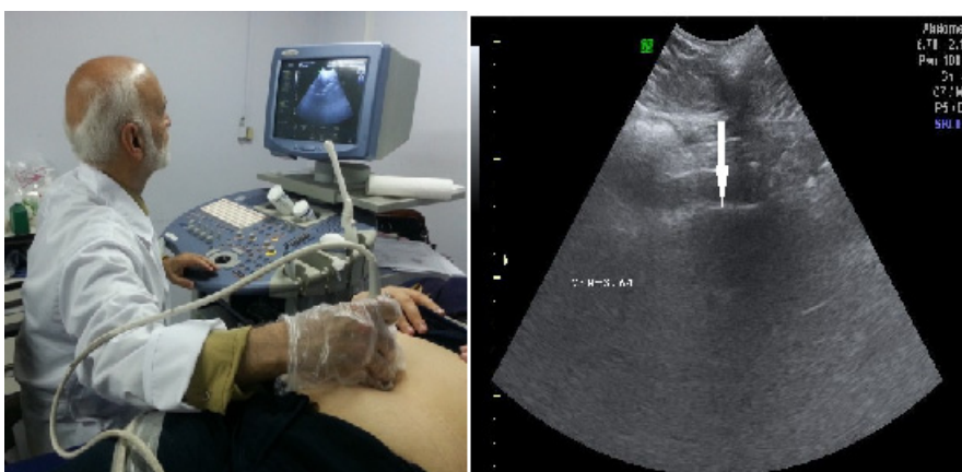
Fig. 2. Measurement of visceral abdominal fat with ultrasound