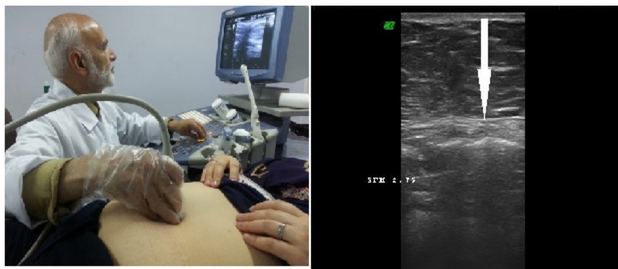
Fig. 1. Measurement of Subcutaneous abdominal fat with ultrasound