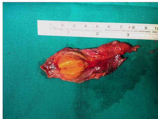
Fig. 2 Gross appearance of the adrenal gland.