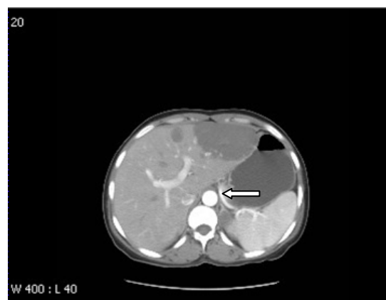
Fig.1. CT scan of the adrenal gland.

On gross examination, the mass was golden-yellow in colour without evidence of necrosis or hemorrhage (Fig.2). Histopathological examination of the mass showed features of adrenal adenoma, without necrosis,