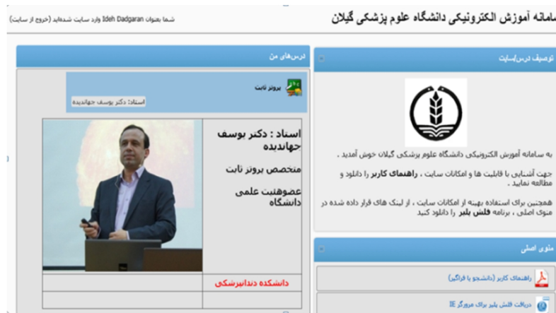
Fig. 1. Sample of instructional content uploaded on LMS

lesson subjects and simultaneously, the slide demonstration together with the teacher's sound and image were presented (Figs. 1-3). Content output in Sharable Content Object Reference Model (SCORM) format was saved to make Learning Management System (LMS) load- ing possible. SCORM is a standard for edu-