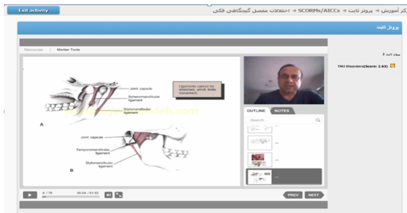
Fig. 2. Fixed dental Prosthesis lesson multimedia example produced by iSpring software