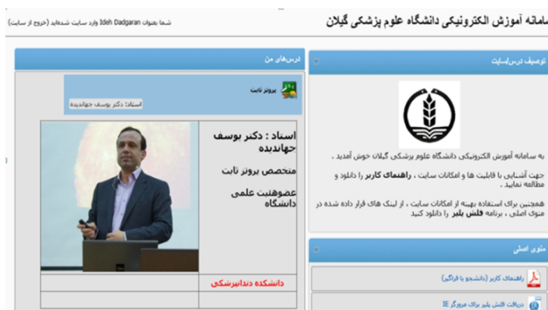
Fig. 1. Sample of instructional content uploaded on LMS

lesson subjects and simultaneously, the slide demonstration together with the teacher's sound and image were presented (Figs. 1-3). Content output in Sharable Content Object Reference Model (SCORM) format was saved to make Learning Management System (LMS) load- ing possible. SCORM is a standard for edu-