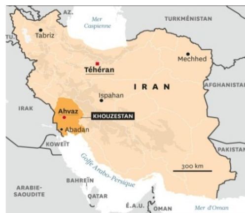
Fig. 1. Location of Ahvaz in Iran

The association between respiratory mortalities with mean daily air pollution was analyzed using a quasi-Poisson, second degree polynomial constrained, distributed lag model using single and cumulative lag structures, adjusted by trend, seasonality, temperature, relative humidity, weekdays, and holidays. Single day lag effects of air pollutant exposure were estimated for 1 to 14- day lags. Distributed lag models (DLM) with 0 to 14- day lags