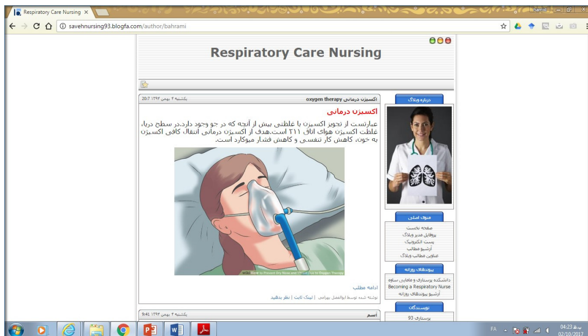
Fig. 2. Example of the weblog page

The students were asked to design an educational weblog for respiratory disease nursing. Before initiation of the intervention, the participants' attitudes about virtual education was measured using Attitude Towards Virtual Education Questionnaire, and then, they developed a weblog as a group work and based on task assignments. The content included topics determined by the lecturer, and the participants were allowed to mention their name in the weblog as well. For instance, after discussing the topic asthma in the class, some of the students would prepare the content (pictorial if possible) and post it on the weblog and mention their name at the end. Then, the lecturer and other students could send feedbacks, and the final work of each group would be evaluated based on the feedbacks. This process was followed until the end of semester, and then, the participants were asked to fill out the questionnaire once again (Figs 1, 2) (blog address: http://saveh nursing93.blogfa.com ).