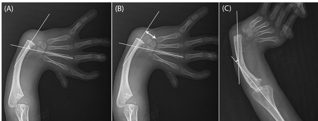
Fig. 1. Assessment of forearm angles based on Manske method; (A) Hand-forearm angle; (B) Hand-forearm position; (C) Ulnar bow

The centralization approach was performed to correct the RCH (Fig.2). The incisions were different, as the surgeries were performed by 3 different hand surgeons. However, the rest of the operations were done in accord-