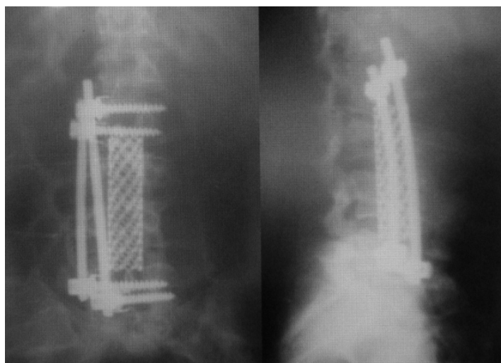
Fig.2. Postoperative radiographs. Plain anteroposterior and lateral view of the lumbar spine, postoperatively taken in the same patient depicted on figure 1. The patient was operated anteriorly by radical debridement, anterior reconstruction with mesh cage and bone graft, and rigid anterior instrumentation.

Chest x-ray revealed that 7 out of 23 patients (30%) had some evidences of pulmonary involvement but active pulmonary tuberculosis was only present in 3 cases (13%). Prevalence of HIV infection in our patients was 17.3% (4 cases). The mean follow up period was 31.4 months (range; 24-52, SD=6.4).