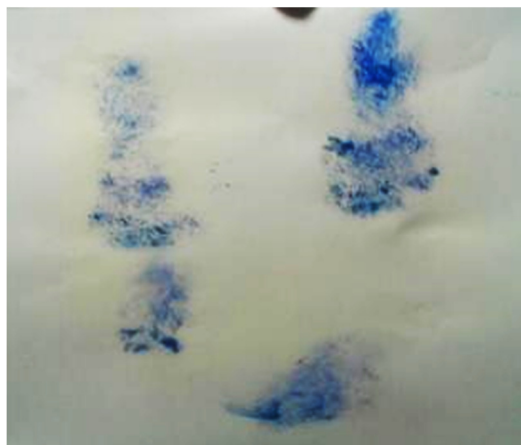
Fig. 3. A rabbit's footprints sixteen weeks post-surgery.