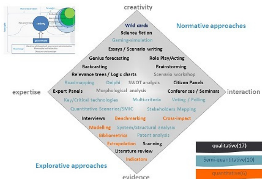
Fig. 3. Widely used methods of futures studies based on futures studies approaches and criteria (17)

community in the model of futures studies and is placed in the litany layer. The methods that are in the pole of interaction and expertise are equivalent to a critical approach. In fact, these 2 poles are the middle layers in the CLA that create structures and establish the relationship between doctrine and evidence.