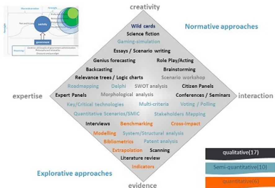
Fig. 3. Widely used methods of futures studies based on futures studies approaches and criteria (17)

community in the model of futures studies and is placed in the litany layer. The methods that are in the pole of interaction and expertise are equivalent to a critical approach. In fact, these 2 poles are the middle layers in the CLA that create structures and establish the relationship between doctrine and evidence.