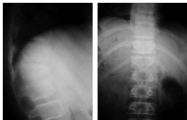
Fig. 2. T12 wedge fracture in a 12 year old boy due to a fall.