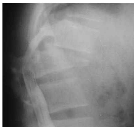
Fig. 3. T12-L1 fracture dislocation in a 17 year old boy due to motorcycle accident.