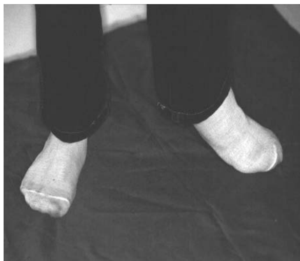
Fig. 5. Nine months later. Time to full weight bearing.

ers the mechanism of the trauma, the location, the extent and type of fracture, involvement of soft tissues, and neurovascular impairment. The type of tibial fracture is related to the mechanism involved in its pathogenesis, ie, contusive, clean-cut, tear, degloving, crushing, avulsion, and burst (high speed). Usually, crushing, avulsions, or high-speed bursting injuries lead to more complex defects.