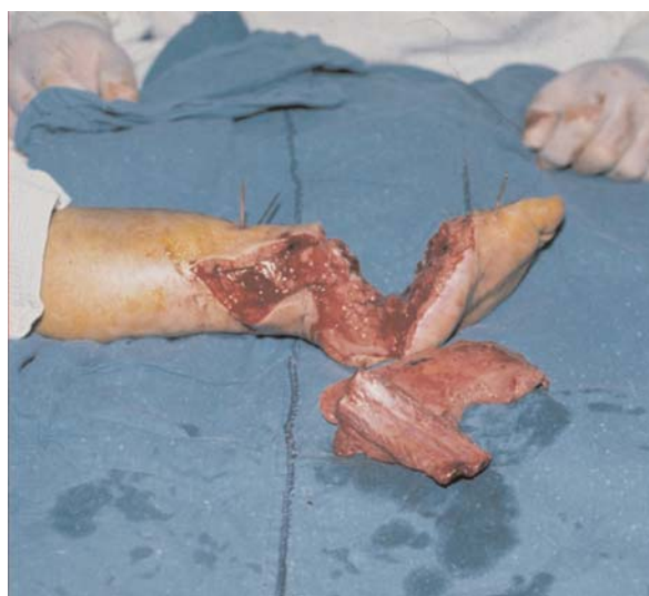
Fig.1. Two ribs were harvested and prepared for transposition.