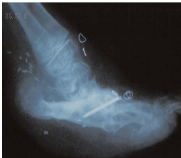
Fig. 4. Six months after operation.