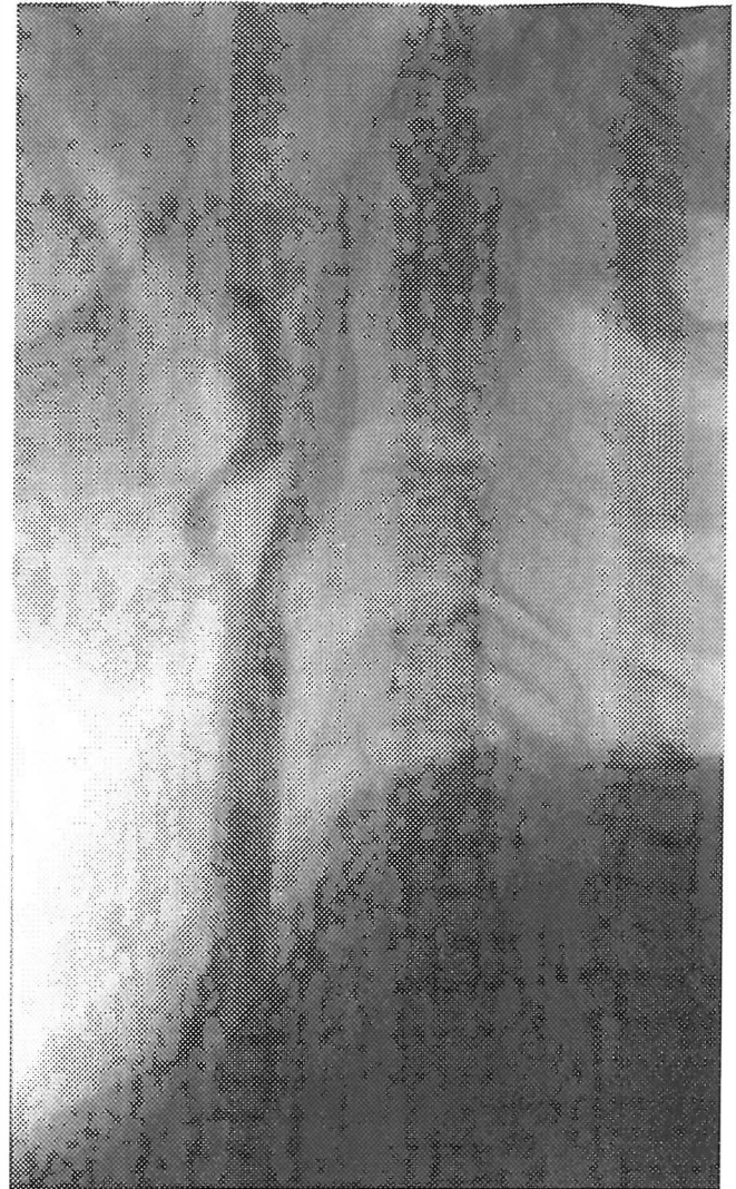
Fig. 2e. Undilated stent.

Standard retrograde access was achieved through the common femoral artery, with a 7F vascular sheath. A 0.035