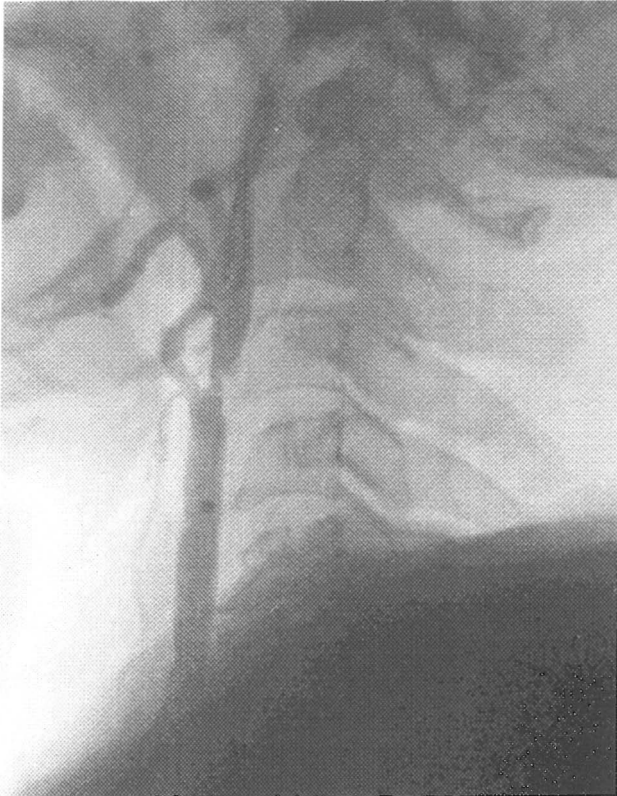
Fig. 2d. Stenosis after predilation.

a new neurological deficit that persisted for >30 days and increased the NIHSS by >4. Finally, fatal stroke was defined as death attributed to an ischemic stroke or intracerebral hemorrhagic stroke.