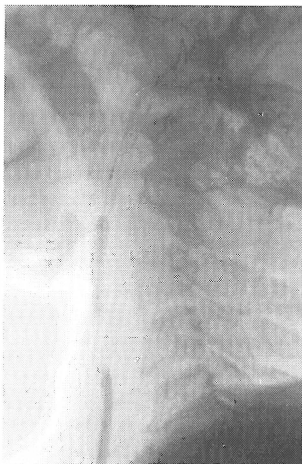
Fig. 2c. Filterwire with predilation of stenosis.