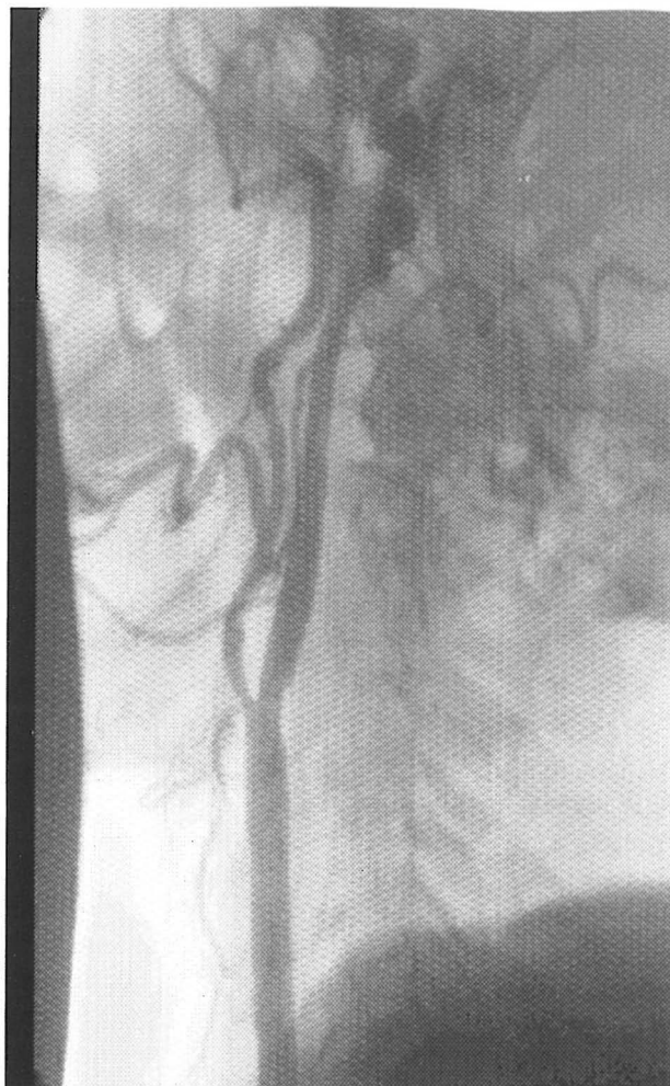
Fig. 2g. Final result.

Carotid stenting was carried out by use of self-expandable stents in all cases. The stents were two types, Boston scientific carotid wallstent (15 cases) and Guidant Acculink (6 cases). Predilation was performed with coronary balloons in tight or subocclusive carotid stenosis. The predilation balloons were routinely undersized (Artery/balloon ratio: 1.8 to 1.5) to reduce vessel dissection and/or distal embolization. Stent placement was optimized with postdilation by using suitably sized balloons based on quantitative analysis of the vessel. During the postdilation phase, atropine (1 mg IV) was given to all patients before inflation to reduce the bradycardia and