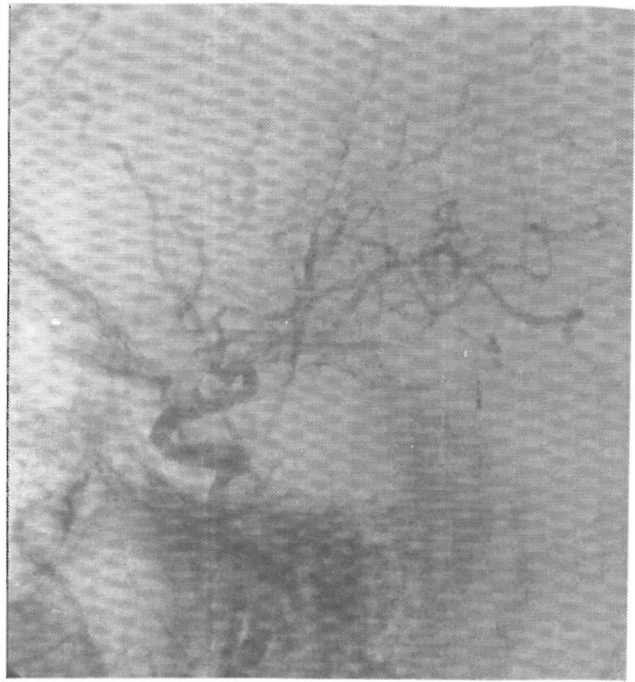
Fig. 2b. Brain flow before angioplasty.