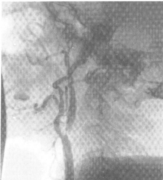
Fig. 2a. Left internal carotid ( LICA ) stenosis.