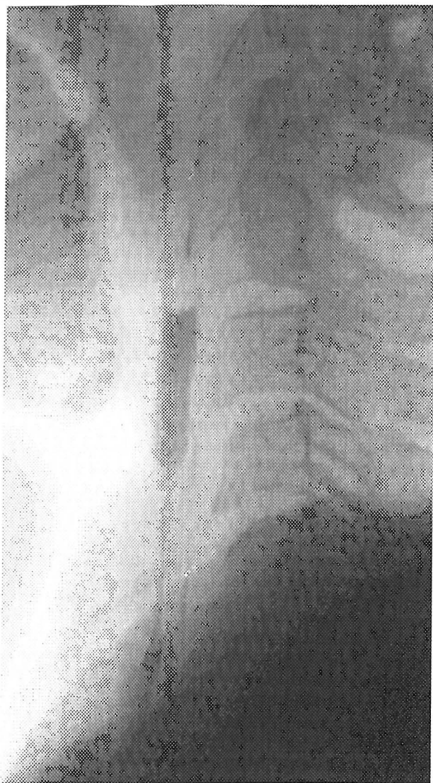
Fig. 2f. Post-dilation of stent.

cases) and filter device Accunet, Guidant (6 cases). (Figure 2)