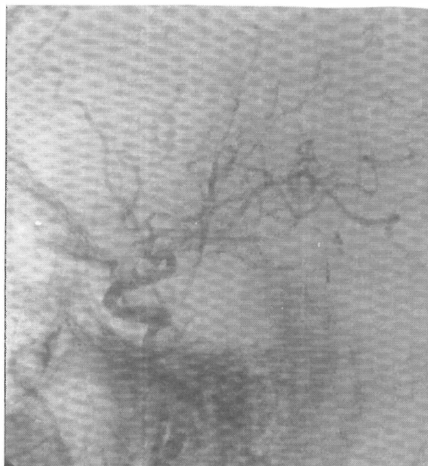
Fig. 2b. Brain flow before angioplasty.