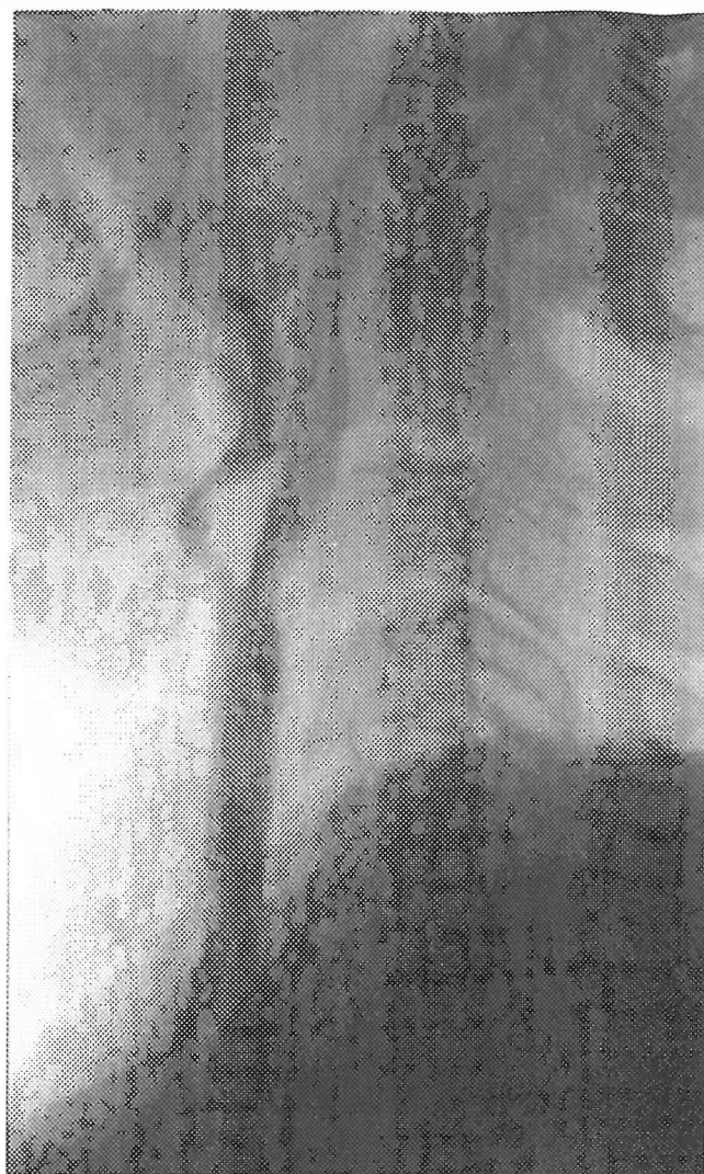
Fig. 2e. Undilated stent.

Standard retrograde access was achieved through the common femoral artery, with a 7F vascular sheath. A 0.035