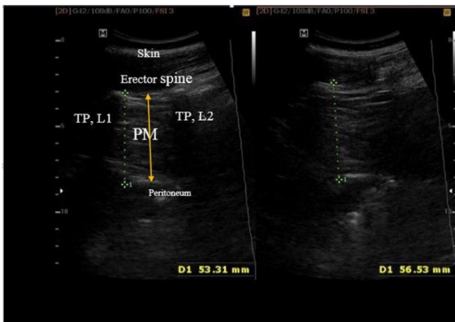
Fig. 1. The PM thicknesses in a healthy participant in rest (right) and during contraction state (left) in L2 segment. (PM, psoas major, TP: Transverses process, L1, L2 lumbar segments).