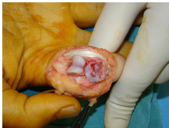
Fig. 1. Shot-gun approach was completed to expose the PIP joint. The fracture was much comminuted and fixation was not feasible.