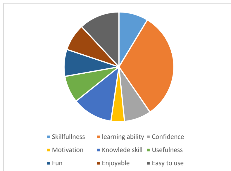
Fig. 2. The outcome and effects of virtual technology on students

omy .On average, 123 students were trained simultaneously or gradually in each training project .The results of Table 3 show that 78% of the students trained with virtual