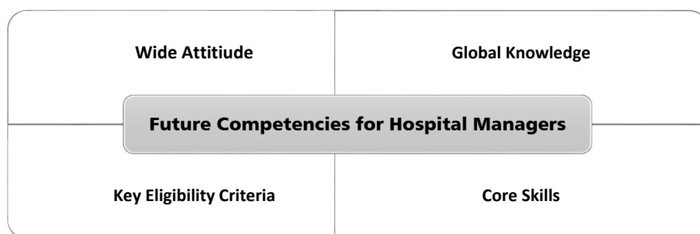
Fig. 2. Four Dimensions of Future Competencies for Public Hospital Managers

The theoretical knowledge is obtained through education at the university level. Development of knowledge is the cornerstone of skills and attitude and does not have much influence on the development of managerial competencies by itself (53, 54). With reviewing the studies on the future competency of hospital managers, 23 knowledge were